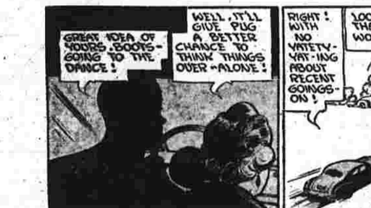
PRISCILLA'S POP BY AL VERMOR