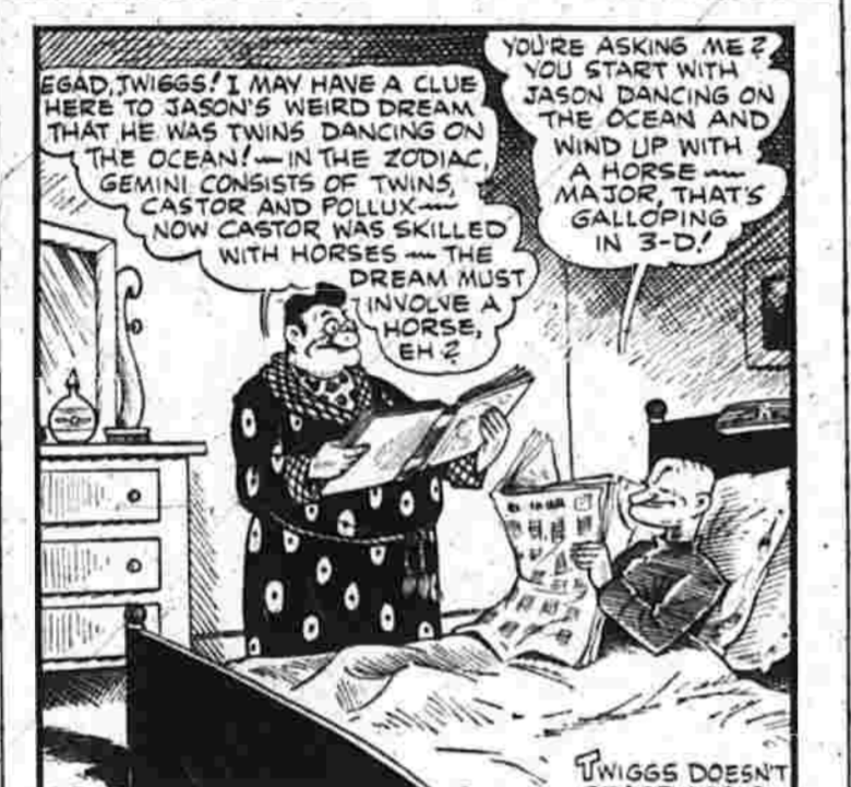
Dragon Hunting? BY V. T. HAMLIN